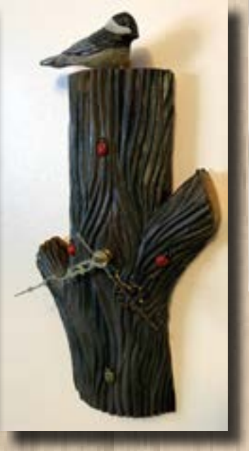
Left side view Right side view